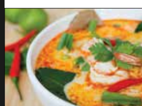
Tom Yum Shrimp Soup