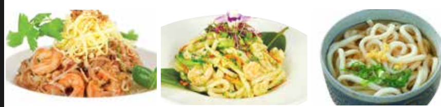
Shrimp Pad Thai Shrimp Yaki Udon Udon Soup

* Discounts are not valid on all party tray menu