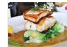
Pan Roasted Chilean Sea Bass