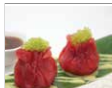
Tuna Dumpling (4 pcs)