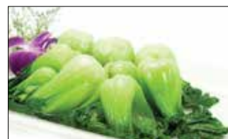
Baby Bok Choy