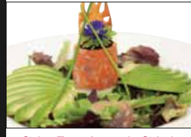
Spicy Tuna Avocado Salad