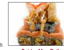
Spider Man Roll