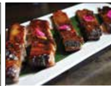
Honey Back Ribs