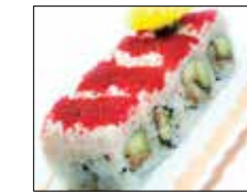
Super Dragon Roll