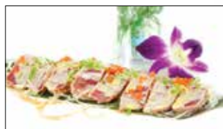
Blackened Tuna Tataki

Food Allergies? If you have a food allergy, please speak to the owner, manager, chef or your server