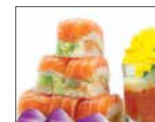
Sushi Box Cake w. Salmon